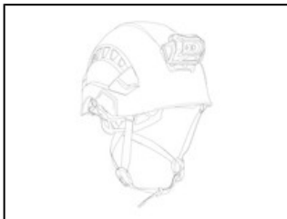
Plate for mounting a headlamp on a Petzl VERTEX or STRATO helmet, maintaining the ability to tilt the headlamp.

The SLOT ADAPT plate allows you to mount a compatible headlamp on a VERTEX or STRATO helmet.